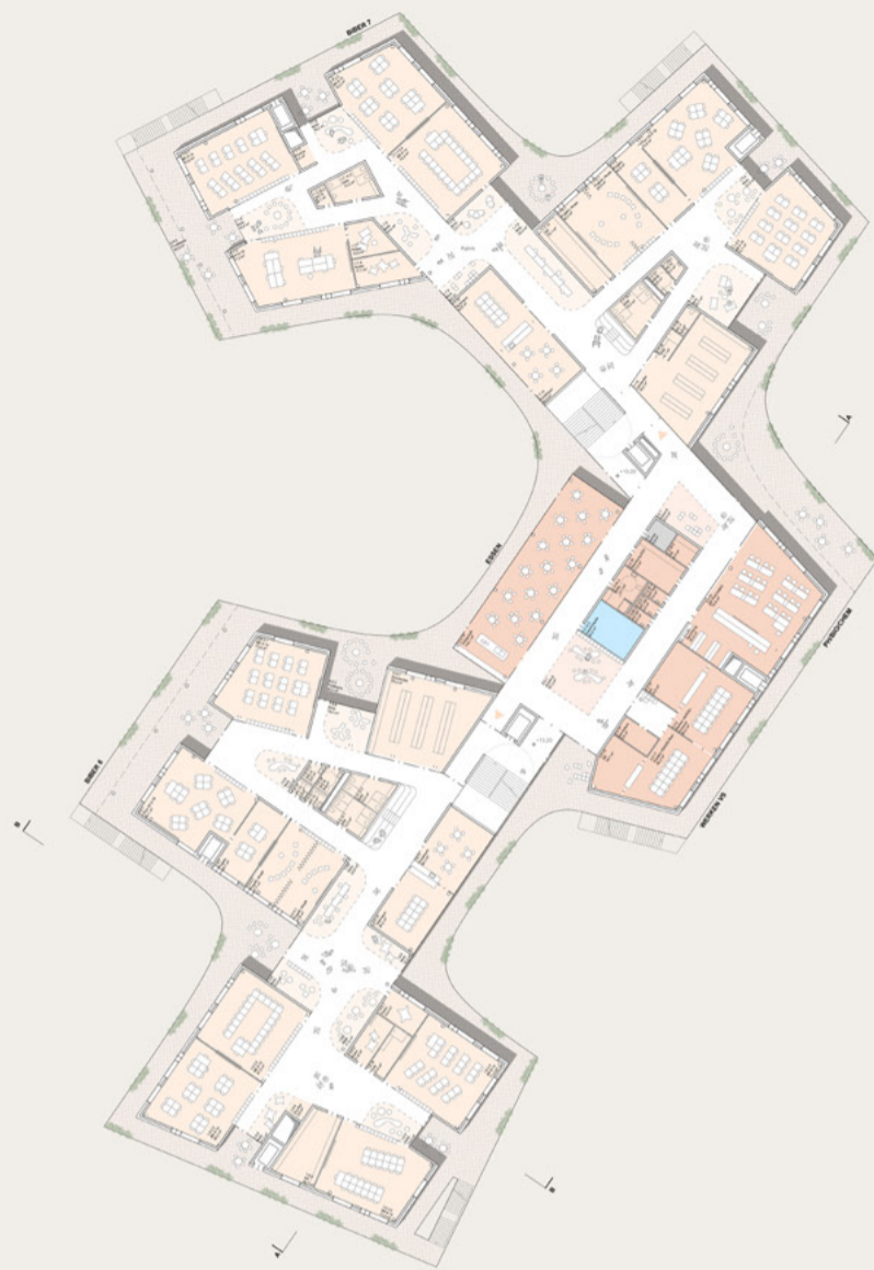
3. OBERGESCHOSS 1:250