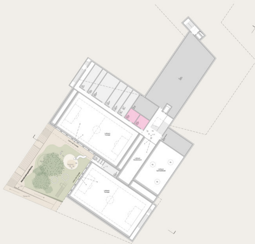
1. UNTERGESCHOSS 1:250