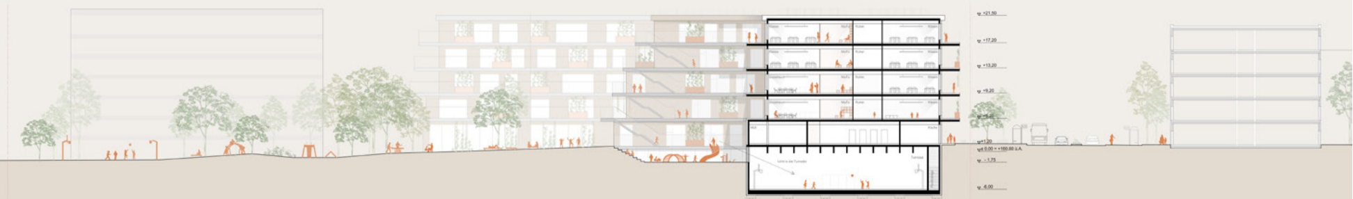
ANSICHT VERBINDUNGSSTRASSE 1:250